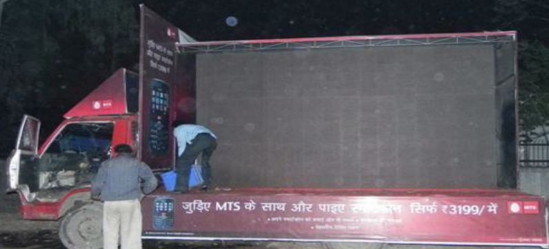
MTS Pan India Campaign