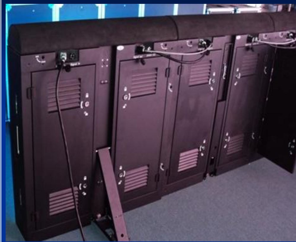
Iron cabinet Back view