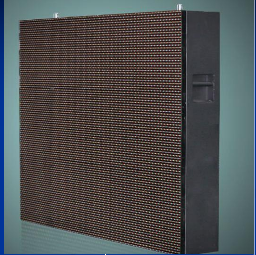
cabinet front view